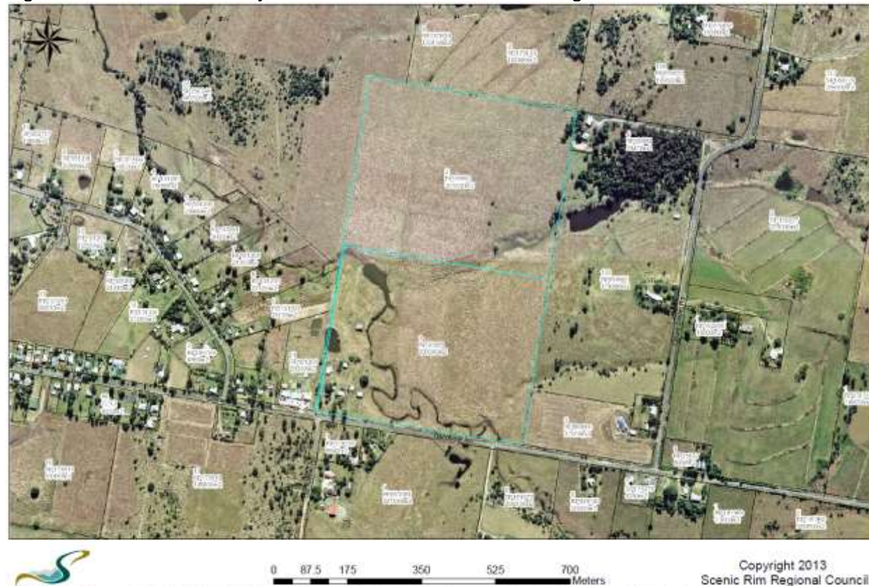
Figure 1 - Aerial view of subject site and immediate surrounding area

The subject site is located at 163 Teviotville Road, Kalbar more accurately described at Lots 1, 2 and 5 on RP20983. The site has an area of 40.14ha and is currently void of any significant vegetation with the exception of a few ornamental trees around the existing dwelling and associated structures. The site is undulating in nature with a waterway that traverses the site. The site is currently improved by a residential dwelling and sheds for associated farm activities and machinery. Refer to Figure 1 below which shows an aerial view of the subject site and surrounding properties.