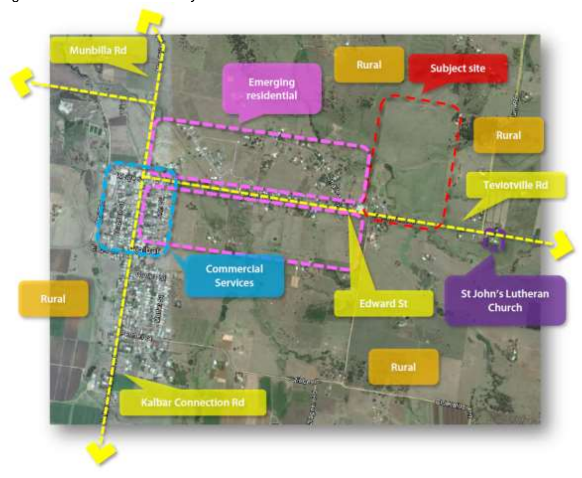
Figure 2 - Site surrounds analysis

Refer to Figure 2 below which shows an analysis of the surrounding landuses close to and surrounding the subject site.