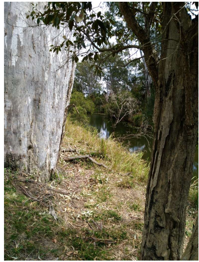
Figure 1: Eucalyptus tereticornis and other vegetation on the banks of the Logan River

Cat's claw creeper is an aggressive climber with the ability to completely smother native trees including Queensland Blue Gums ( Eucalyptus tereticornis ) which feature prominently along the Logan River and play a significant role in keeping the river banks stable.