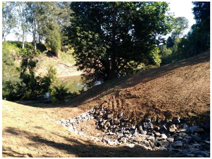
Figure 3: Gully stabilisation beside the Logan River

In the priority reach, the Resilient Rivers Initiative has funded a gully restoration project using a combination of gully bank battering, rock chutes and a stilling pond to slow down water and reduce sediment flow into Logan River. New projects are under investigation.