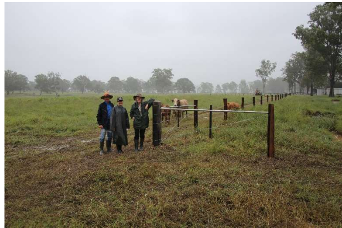
Figure 4: Stock fencing and off-stream watering to create refuge gullies on Days Creek

Water provided by the off-stream watering points contributes to improved stock management, the health of livestock and cleaner instream water.