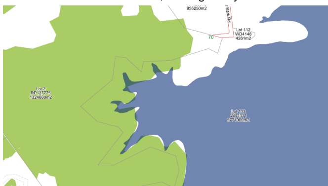
Figure 4: Illustrates the presence of data sitting underneath the Waterbody feature on Overlay Map 4A - Environmental Significance - Biodiversity at Maroon Dam

In some instances, there is also data present underneath these locational features that cannot be seen unless the locational features are removed (see Figure 4). Removing this data will streamline mapping and the map processing time in the ePlan environment, making the system faster for customers.