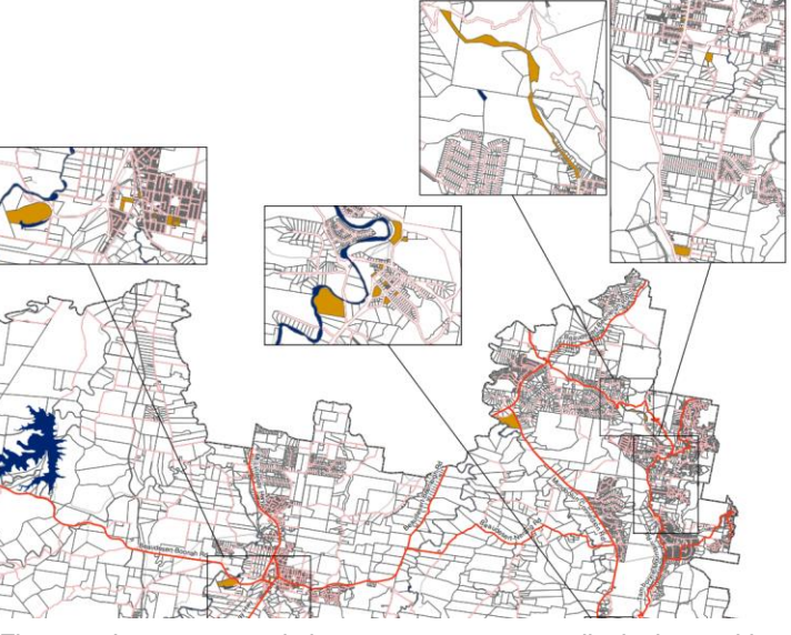
Figure 3: Inserts currently have no street names displaying making it more challenging to locate a property.

does not materially affect the remainder of the instrument.