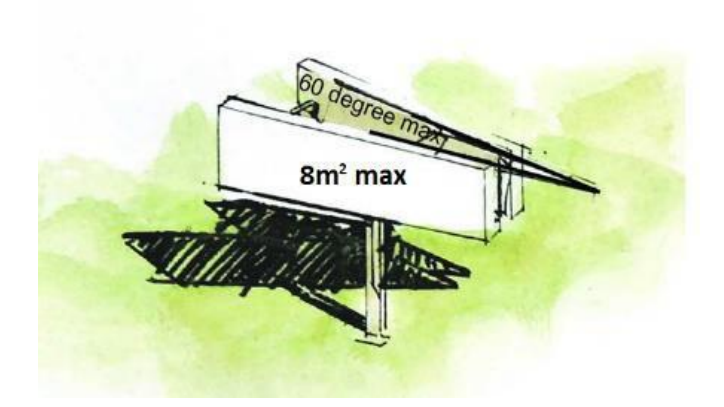
Figure 2 - Example of maximum sized sign

Third party billboard signs are not consistent development in residential zones .