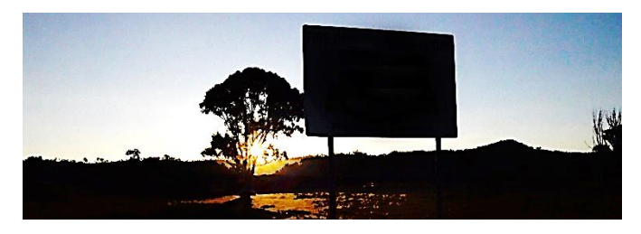
Typical billboard signs

2. Third party billboard sign - An off-premises advertising device with a total face area of 4m<sup>2</sup> or more. The term includes a free standing sign, billboard sign or a sign affixed to a structure.