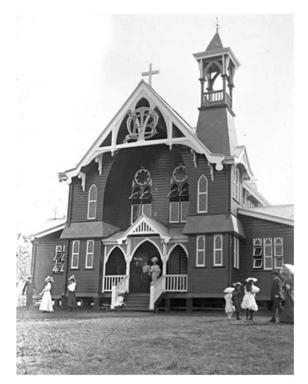
St Mary's Catholic Church, Beaudesert, c.1910 (Local Heritage Place)

Likewise, in some cases there may be benefits in the owner/developer engaging the services of a suitably qualified heritage consultant to provide advice regarding more substantial works. This will protect the property's heritage significance and safeguard its integrity.