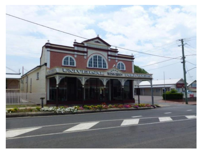
Wiss Brothers Store, Kalbar (Queensland Heritage Place)

Council also has a legal obligation to have a local heritage register. Sections 113 and 114 of the Queensland Heritage Act 1992 ( Heritage Act) require a local government to keep a register of places of cultural heritage significance in its area.