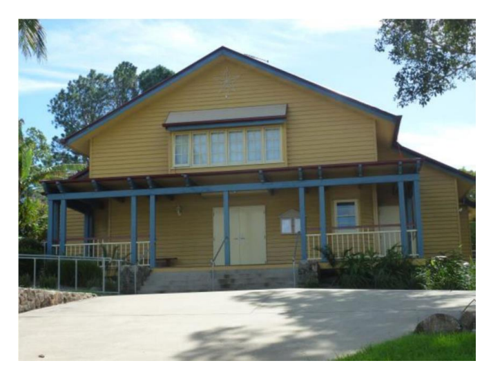
Zamia Theatre, Tamborine Mountain (Local Heritage Place)