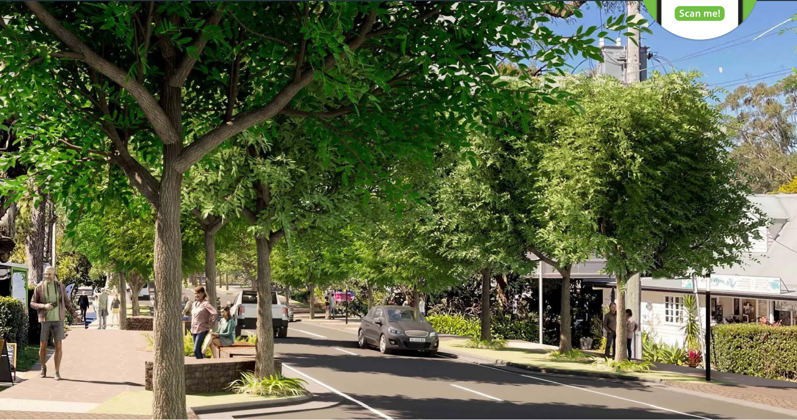
Completed 2022: Artist's impression of Tamboorine Mountain Gallery Walk Precinct

In response to recent community feedback, Scenic Rim Regional Council will be providing monthly progress updates to keep you informed about the Gallery Walk Car Park Construction and Amenities Upgrades.