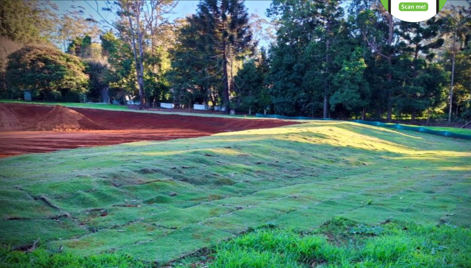
Image of the Detention Basin Construction - June 2025 Walk Precinct

Every effort will be made to reduce noise and minimise the impact of construction activities on the community. Thank you for your patience and understanding as we undertake this significant infrastructure project in the Scenic Rim.