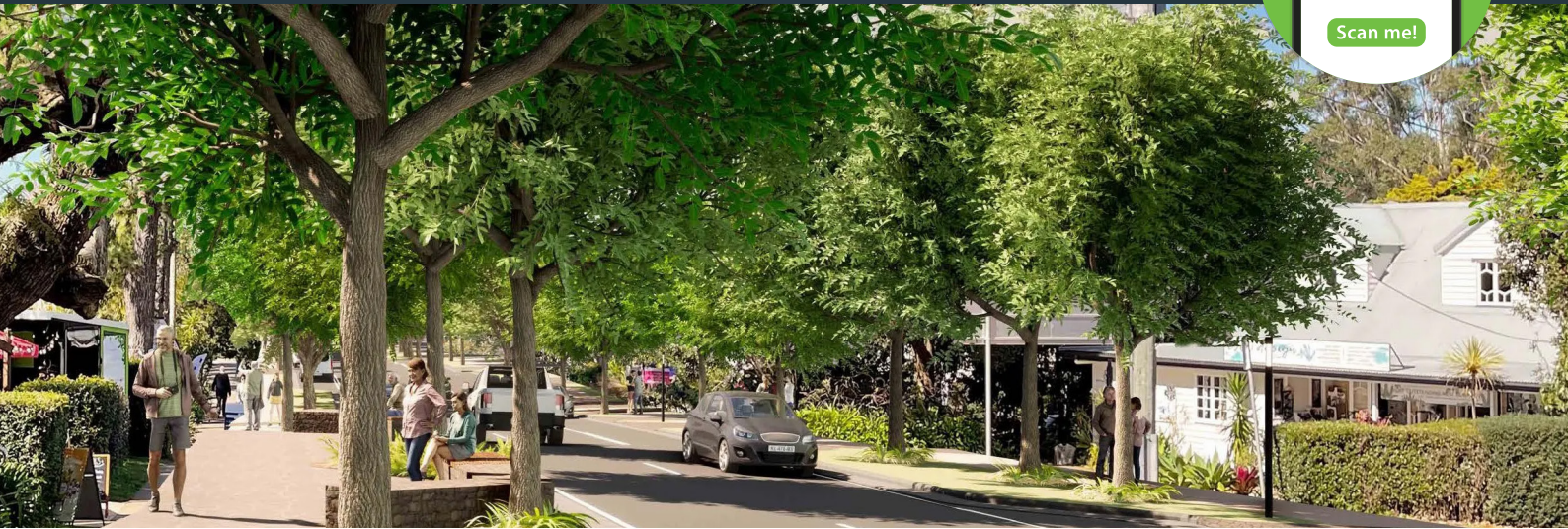
Completed 2022: Artist's impression of Tamboorine Mountain Gallery