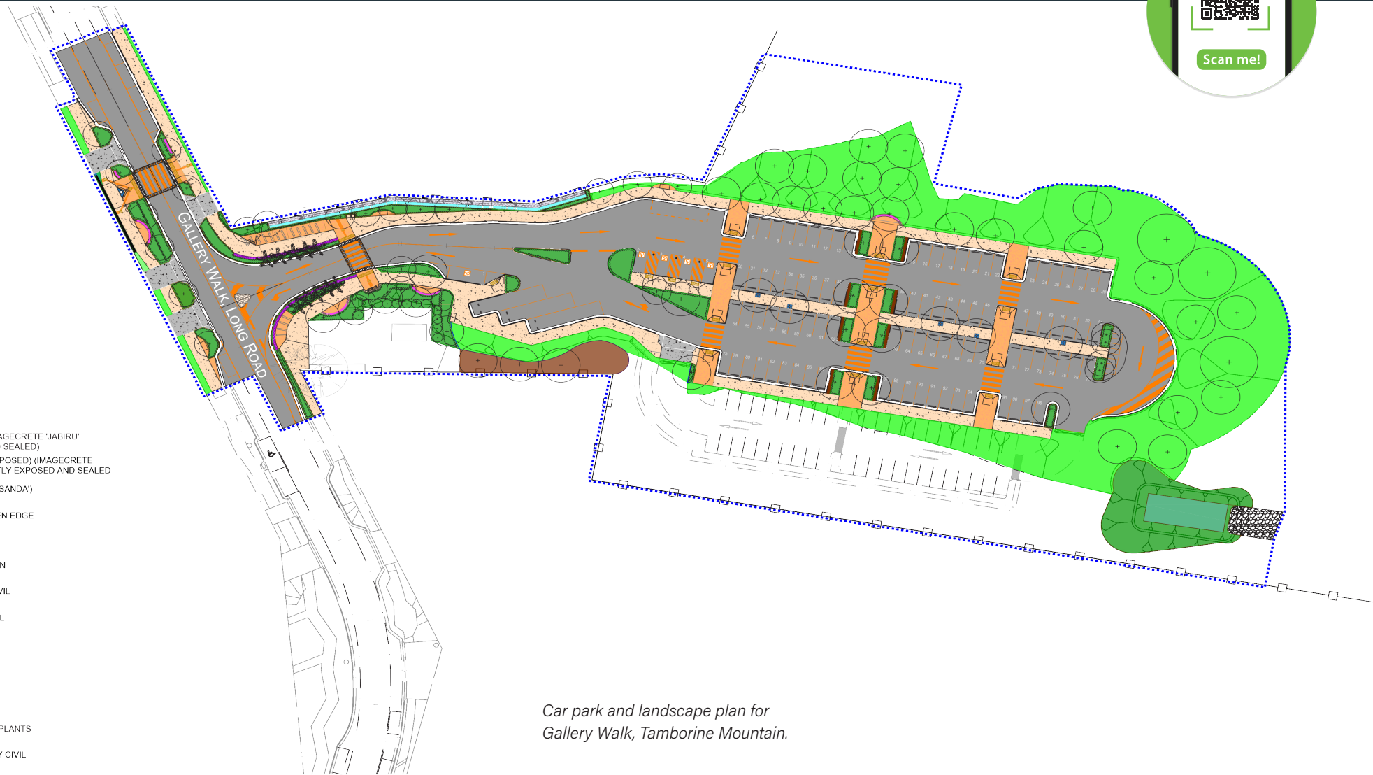
Car park and landscape plan for Gallery Walk, Tamborine Mountain.