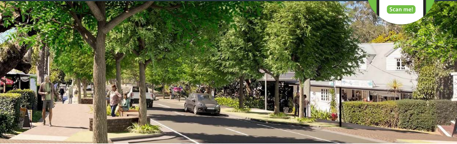
Completed 2022: Artist's impression of Tamborine Mountain Gallery

Favourable weather conditions in June allowed the construction team to make significant progress despite encountering unexpected harder material during recent excavations.