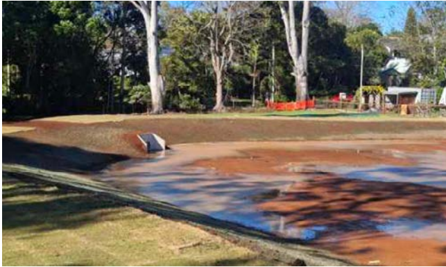
Detention basin showcasing headwall installation