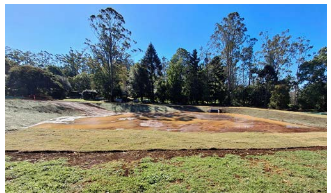
Detention basin Walk Precinct

The lower sub-base layer of the car park has been prepared ensuring a strong foundation in preparation for the finishing layer works to commence.