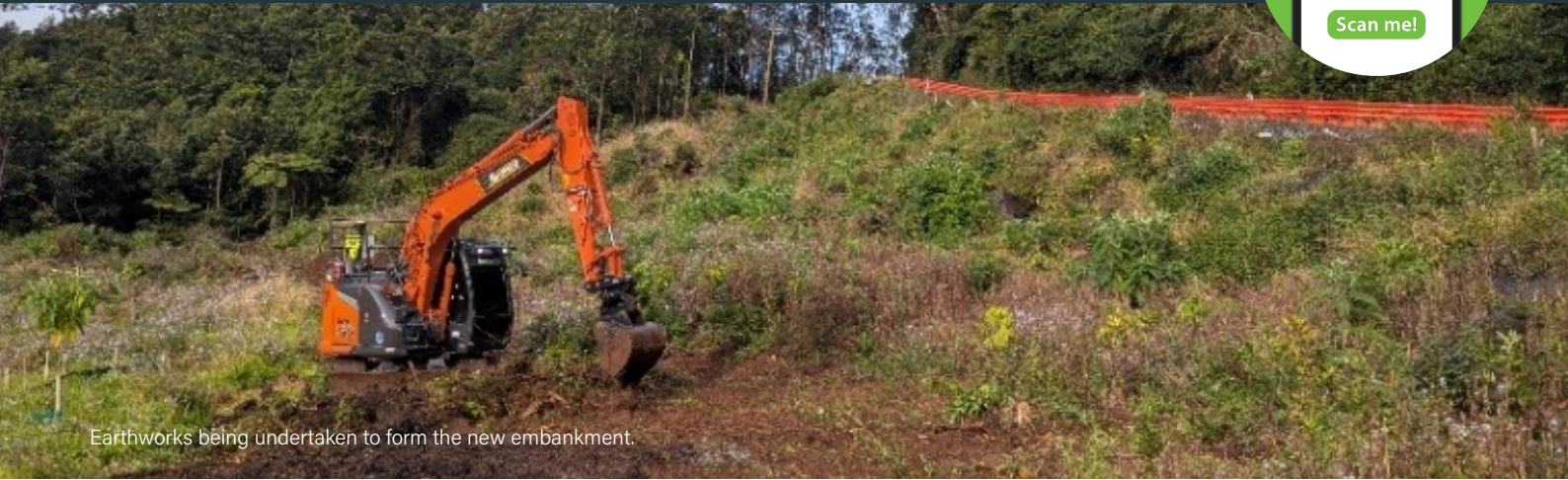
Earthworks being undertaken to form the new embankment.

Welcome to the first edition of The Shelf Road, Tamborine Mountain, Project Update. Scenic Rim Regional Council is dedicated to community engagement which includes keeping you informed through regular updates on key projects.