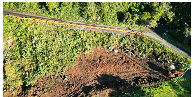
Aerial view of the works along The Shelf Road, Tamborine Mountain

An embankment is a raised earth structure made from compacted soil or engineered fill that supports a road or pathway. In this project, the embankment is being built to create a stable foundation for the new road alignment.