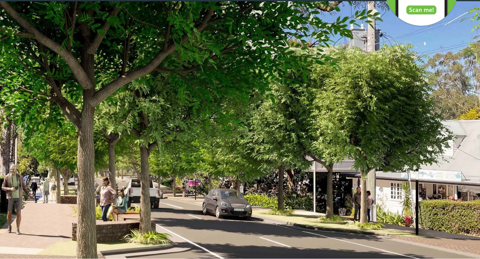
Completed 2022: Artist's impression of Tamboorine Mountain Gallery Walk Precinct

Earthworks for the detention basin are almost completed, despite recent heavy rainfall in July. This month, construction crews are continuing to bring in fill material and complete earthworks, weather and site conditions permitting.