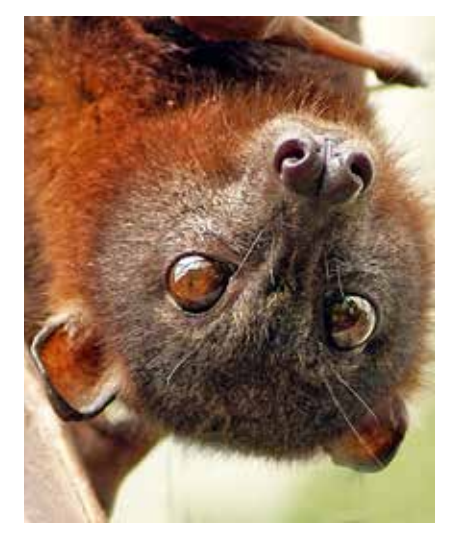
Little Red Flying-fox (Pteropus Scapulatus)