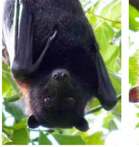
Black Flying-Fox (Pteropus Alecto)

A nomadic species feeding preferentially on nectar. They move seasonally in response to the patterns of flowering eucalypts and paperbarks. They form only temporary roosts, frequently sharing roosts with black and grey-headed flying-foxes.