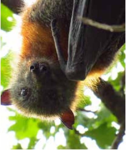
Grey-headed Flying-fox (Pteropus Poliocephalus)