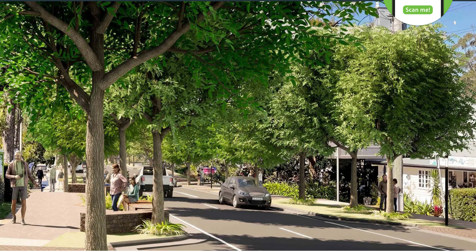
Completed 2022: Artist's impression of Tamboorine Mountain Gallery Walk Precinct

The carpark's foundational works, including kerb and channeling, are shaping the site and offering a glimpse of the final layout.